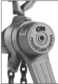
Optional Load Limiter