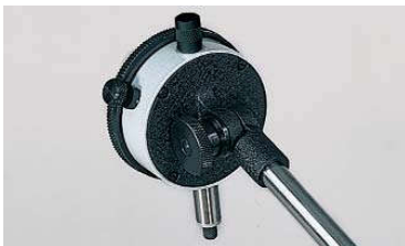
Clamp mechanism grips indicator lug back.