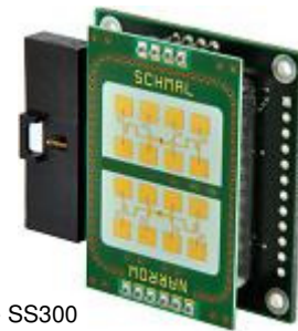
Open Frame SS300

© 2005 to 2010 Houston Radar, LLC., 13814 Sherburn Manor Dr. • Cypress, Texas 77429 http://www.houston-radar.com Toll free 1-888-602-3111